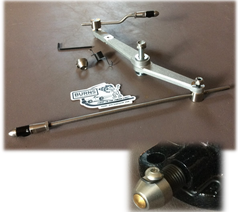
Detail - Throttle Return Set-Up on Single Carb Linkage

Burns throttle linkage kits are now available to ease the installation of single or dual carbs on your Burns manifold. These kits use the Burns aluminum throttle arm, Stromberg rod ends, Stromberg linkage to connect the dual carbs and easily adjustable swivels of our own design. Both feature a throttle return set-up developed in conjunction with Stromberg Carburetor Co. that does away with the need for any additional return springs.